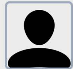
Vacant HUD Administrator