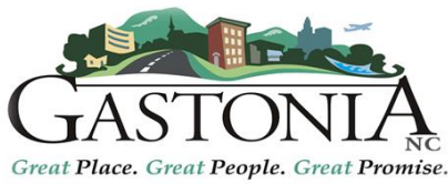
EXHIBIT A Request for Bid

BID DUE December 5, 2026 by 12:00 pm City of Gastonia Community Development Office Garland Building